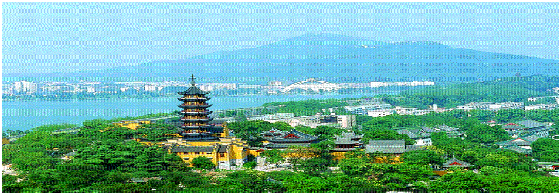
Nanjing with a population of almost 7 million is the capital of the Jiangsu Province and a former capital of China. It is a center of politics, industry, economy and culture.

Nanjing, with a total area of 6,598 km 2 , is situated in the largest economic zone of China, the Yangtze River Delta, which is part of the downstream Yangtze River drainage basin.